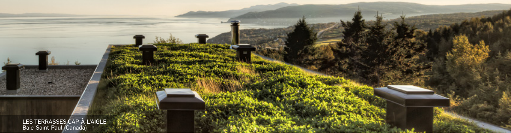
LES TERRASSES CAP-À-L'AIGLE Baie-Saint-Paul (Canada)