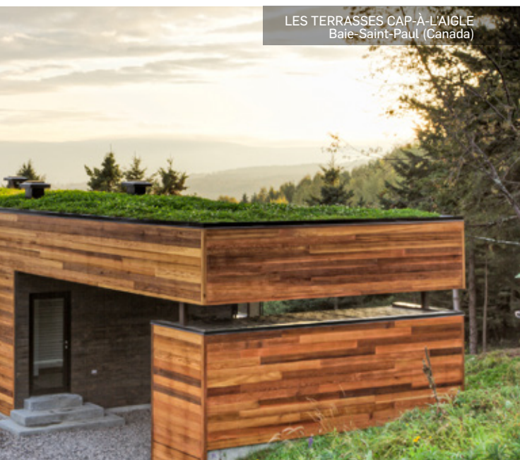
LES TERRASSES CAP-À-L'AIGLE Baie-Saint-Paul (Canada)