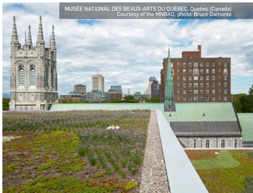
MUSÉE NATIONAL DES BEAUX-ARTS DU QUÉBEC, Quebec (Canada)