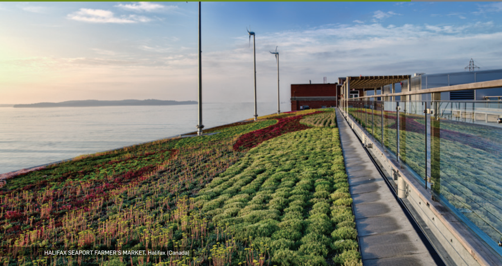
HALIFAX SEAPORT FARMER'S MARKET, Halifax (Canada)