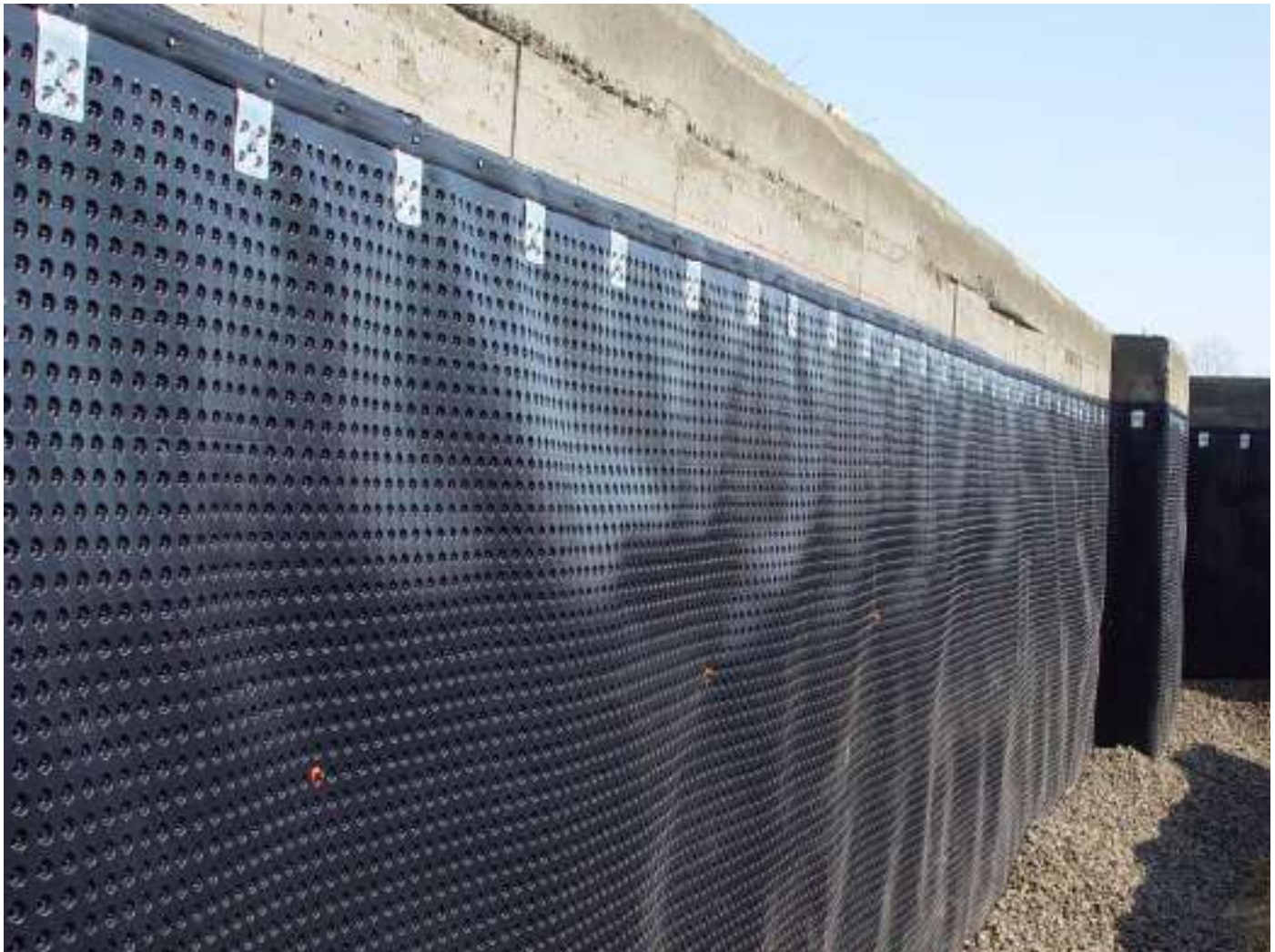
FINISHED INSTALLATION OF PLATON FOUNDATION WRAP