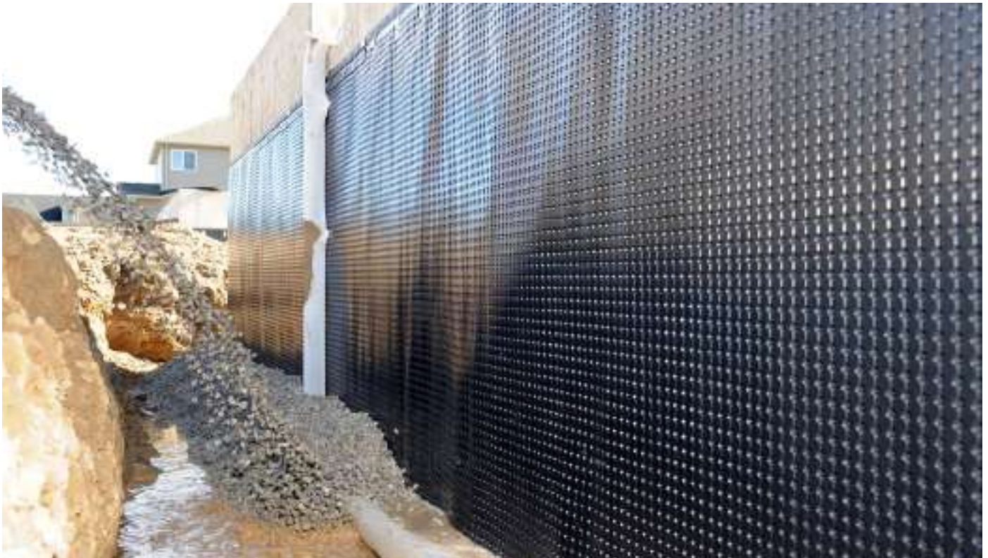
BACKFILLING OVER THE FOOTING DRAIN