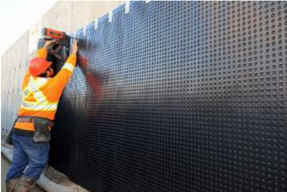
INSTALLING SPEEDCLIPS EVERY 30CM (12")