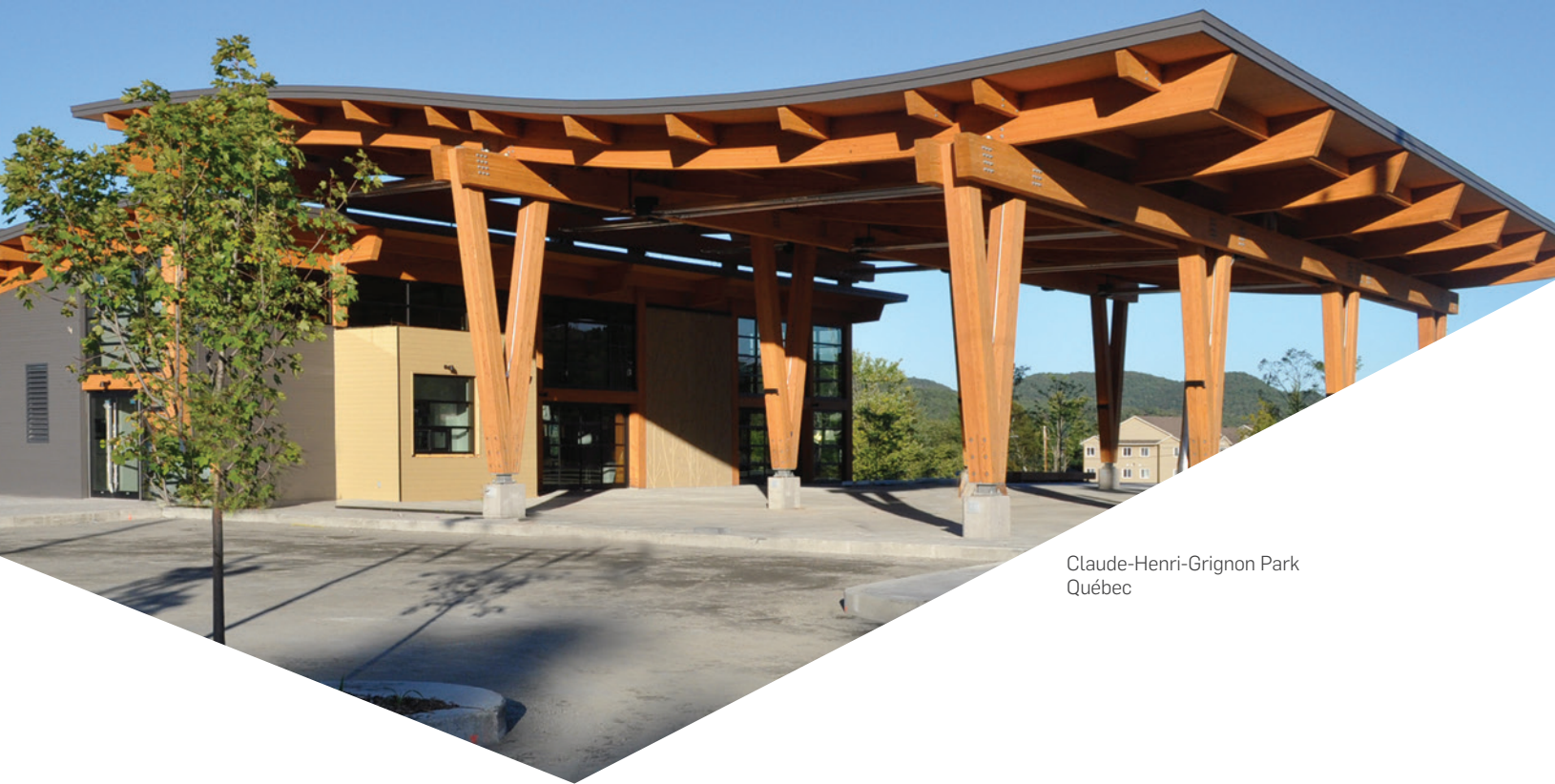
Claude-Henri-Grignon Park Québec