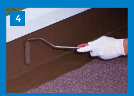
Apply the second layer of ALSAN FLASHING (700 g/m2).