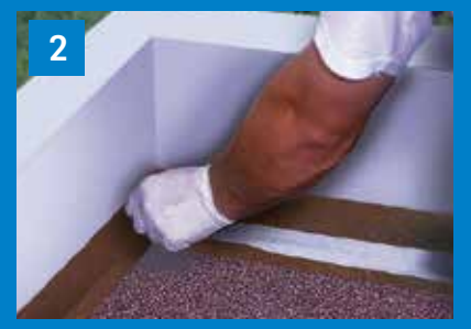
Apply a base coat of ALSAN FLASHING with a brush (500 g/m2) on the surface, lay FLASHING REINFORCEMENT and embed it in the base layer.