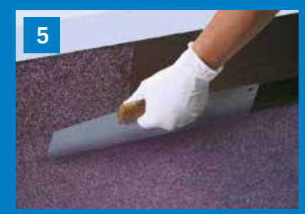
For aesthetic finish (optional), add decorative granules or aluminum color with SOPRALASTIC 124 ALU waterproofing coating.