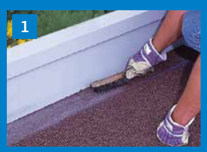
Remove all loose materials and granules from the area with a metallic brush. The area should be clean, dry and free of loose particles.