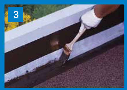
Apply the first layer of ALSAN FLASHING (900 g/m2).