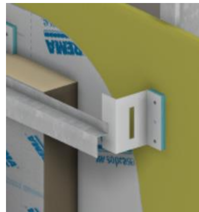
Horizontal Grit Detail