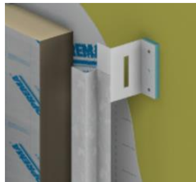
Vertical Grit Detail