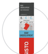
ROOF UNDERLAYMENT HIGH TEMPERATURE LASTOBOND PRO HT-N