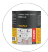
AIR AND VAPOR BARRIER MEMBRANE REDZONE 25