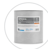
SOPRASEAL STICK VP