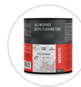
ALL-WEATHER BUTYL FLASHING TAPE